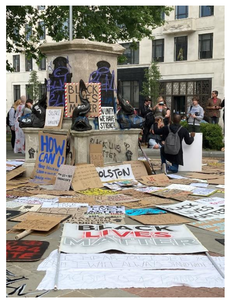
Figure 3: The empty pedestal of the statue of Edward Colston in Bristol, UK the day after it was toppled by protesters. Black Lives Matter placards cover the ground. 2020