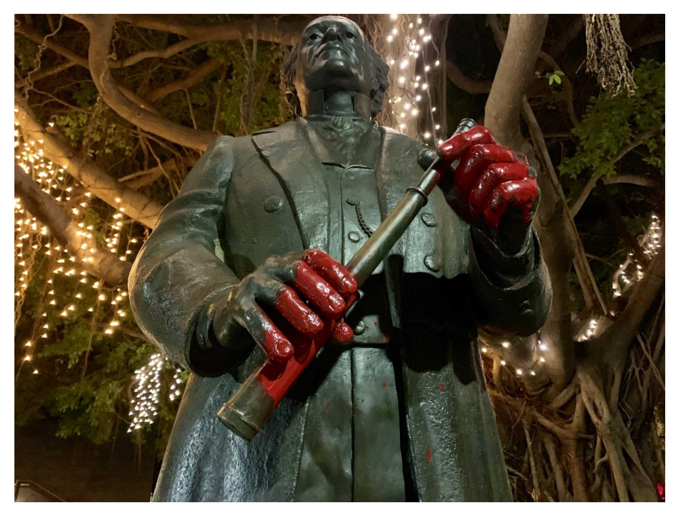
Figure 1: A statue of Robert Towns located in Townsville's city centre with red paint on its hands.

While recent movements abroad calling for the toppling of statues have prompted replication in Australia, this phenomenon is not a new feature of the Australian political landscape, nor can its origins be reduced solely to, say, US influence on national debate. Without understating the significance of BLM-inspired action on statues, anti-colonial challenges to public memory in Australia have a distinctly local character. BLM-inspired attacks on monuments to Captain James Cook, Queen Victoria, and Governor Lachlan Macquarie have been concentrated in the days leading up to Australia Day (26 January) as part of national 'Change the Date' campaigns.